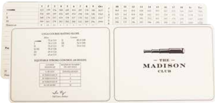
MATTE SMOOTH 4 1/2" x 12" PDD-SCPM545X12