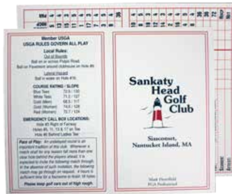
80# COATED 2 SIDES 4" x 6" PDD-SCC2S4X6