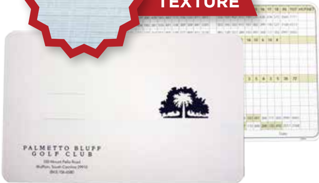
LINEN 6" x 8" PDD-SCPL6X8