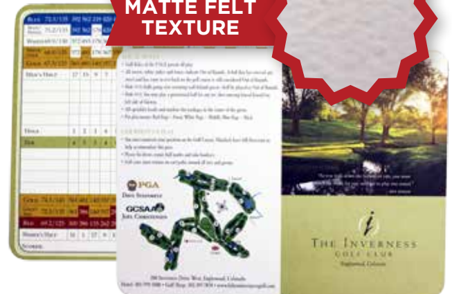
MATTE FELT 6" x 8" PDD-SCPMF6X8