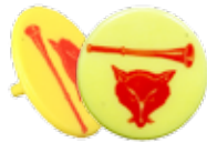
1-COLOR Dime Size, PDD-PD61091 Quarter Size, PDD-PQ62591