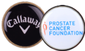
PRINTED WITH DOME HBD-HB-200